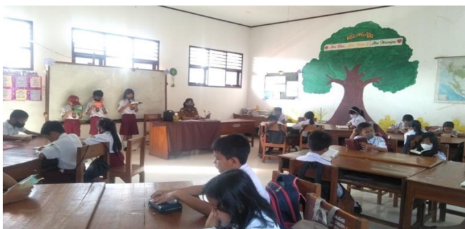
Figure 1. The culture of brief worship in the classroom continues.